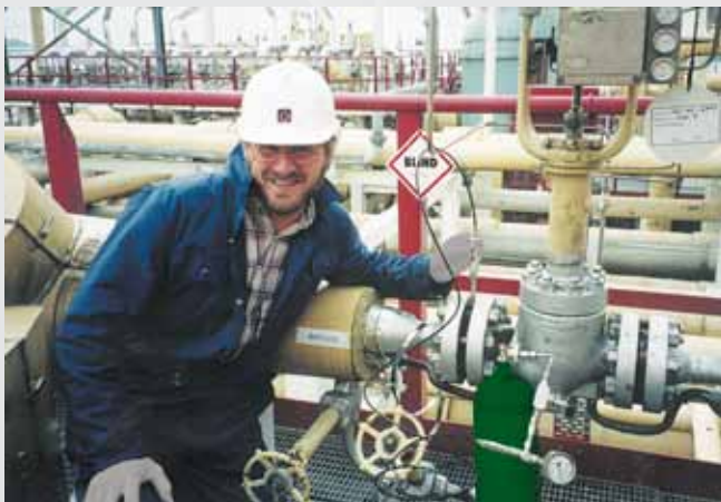
Use of KaMOS ® Nitrogen Test Equipment at site